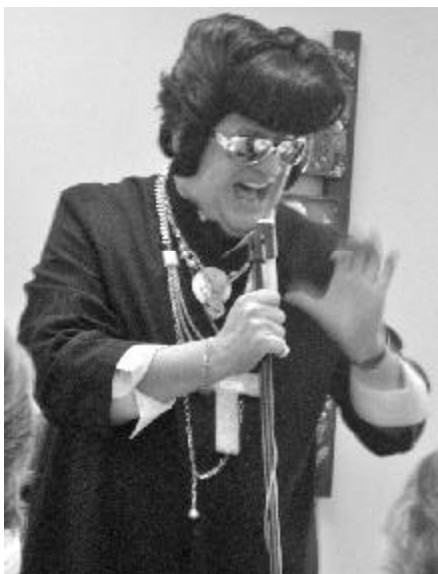
The wig and the bling says it all! Mother Inferior knew how to do karaoke. What’s going on in the convent??