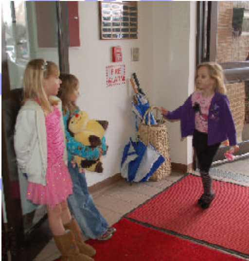
They were greeters.