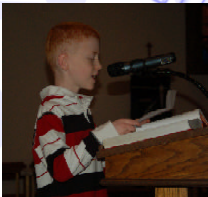
They were lecturers.