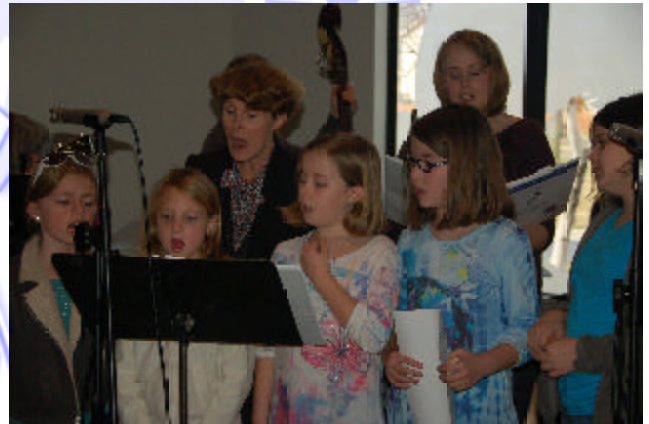
They were choir members.