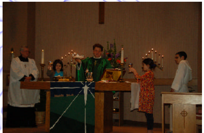
They were Lay Ministers.