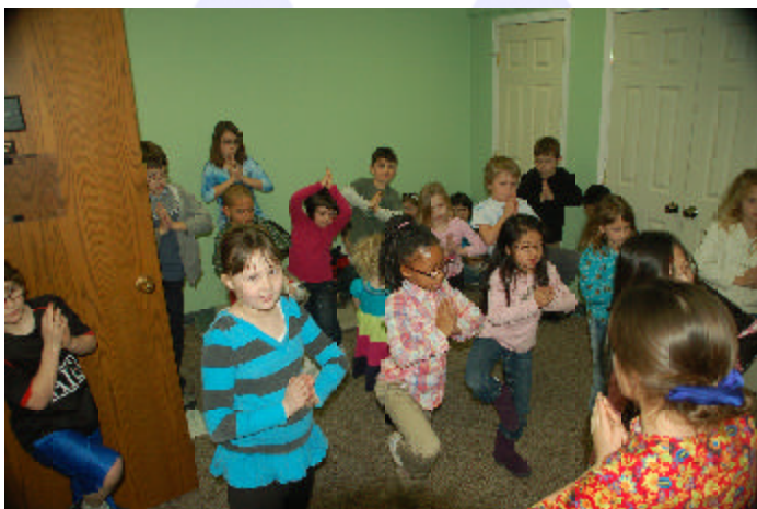
They learned yoga poses.