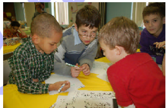
They worked well as a team.