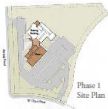
Phase 1 Site Plan