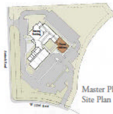
Master Plan Site Plan